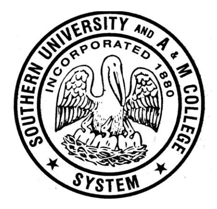
Southern University System