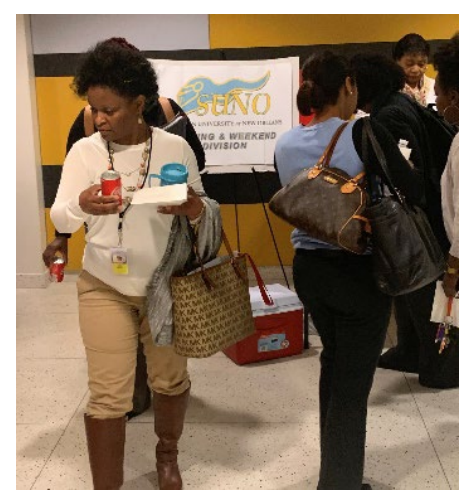
SUNO Evening and Weekend "Meet and Greet" Community Gathering

Non-Traditional Students who are not free during the day are especially invited to take advantage of the evening and weekend programs.