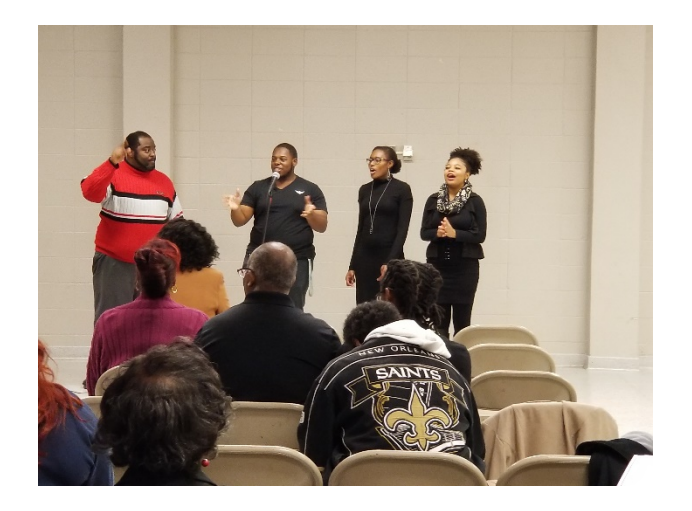
The Evening and Weekend Division supports SUNO Gospel Night.