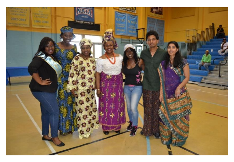
International Day Festival

For a detailed policy of the Residential Life Handbook, please pick up a copy of the handbook from the Office of Residential Life at the Lake Campus, Student Housing Front Office.