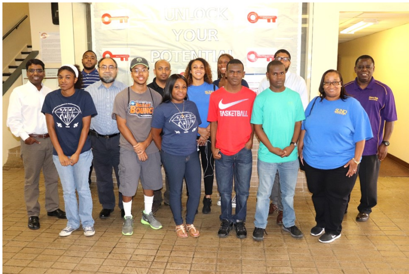
SUNO and ALCORN University collaborate to benefit students in advanced manufacturing and health physics. SUNO students and faculties visited ALCRON university.

faculty, staff, students, and civil service employees. The chair of this committee and members are appointed the Vice Chancellor for Student Affairs and Enrollment Management. A quorum shall consist of five (5) members. The Judicial Hearing Committee studies and recommends to the administration policies relating to student conduct. It serves as a hearing board for individual or group disciplinary cases which are introduced to it for an initial disciplinary action.