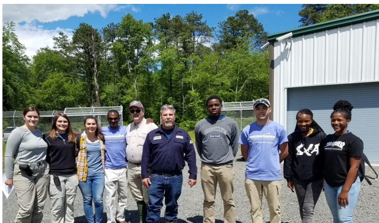
SUNO – BNL Collaboration: Team of Undergraduate Research Interns from Various Universities

Lyceum is a component within the Division for Student Affairs and Enrollment Management. The purpose of the Lyceum Program is to provide students with quality programs that complement the academic mission of the University and enhance the overall educational experience of students by exposing them to various cultures and experiences, ideas and issues, art and musical forms, and styles of life. Funds for the Lyceum Program are generated from a student assessed fee which is included in each student's tuition at the time of enrollment.