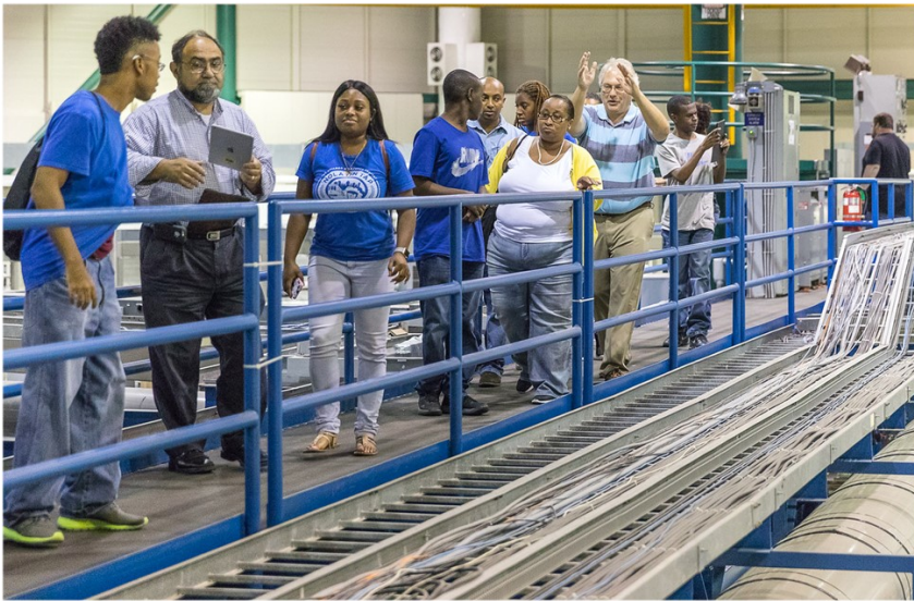
Students visited The Center for Advanced Microstructures and Devices (CAMD) at LSU.