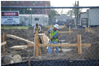
Workers lay the foundation of the Small Business Incubator